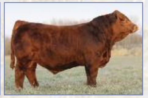
Come As You Are Red Rocket KRGS 29A