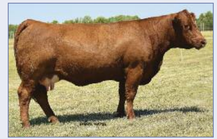
Elllingson Beefmaker Y135

Full brother to Lot 55, homozygous polled and homozygous black.