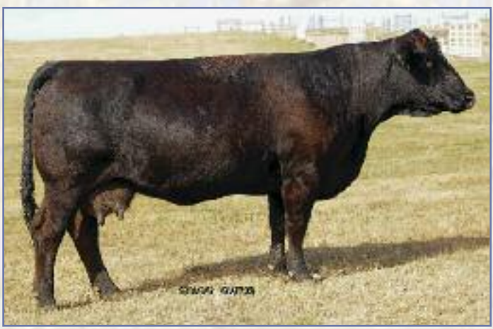
Ellingson MS Pstock N382