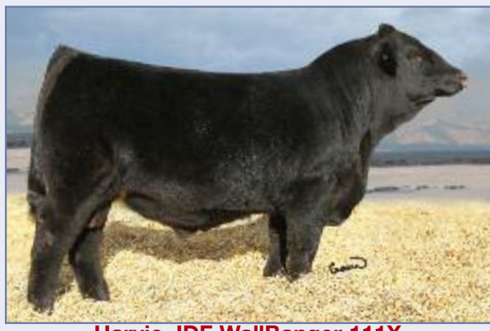
Harvie JDF WallBanger 111X