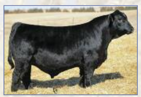
CCR Wide Range 9005A