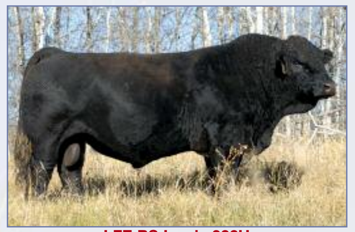
LFE BS Lewis 322U

Full brother to lots 63 and 65, he is homozygous polled, non-diluted cherry red, has great thickness and depth of rib.