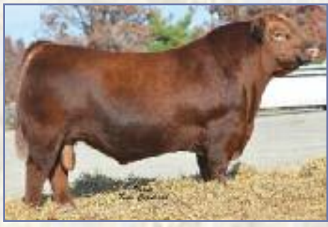
Silveiras Mission Nexus 1378