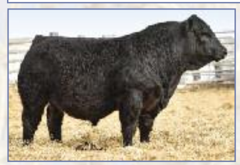
Ellingson Ultimate F830