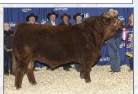
Harvie Red Summit 54B