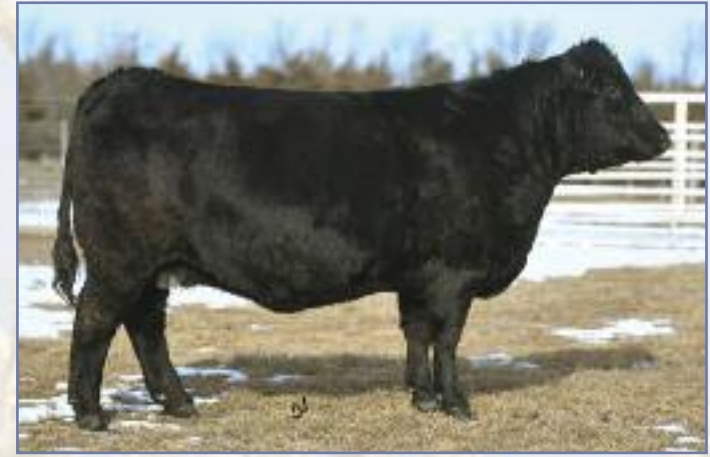
196X (Dam of lots 54 & 55)

An ET son of Riddler that is homozygous black and homozygous polled, we owned his Dual Focus donor dam with Strommens. A true performance powerhouse, Riddler is in the top one percent of the breed for weaning, yearling and ADG EPD's, making this a great combination. Riddler adds power and performance with respectable calving ease. You will love to bring his offspring to town!