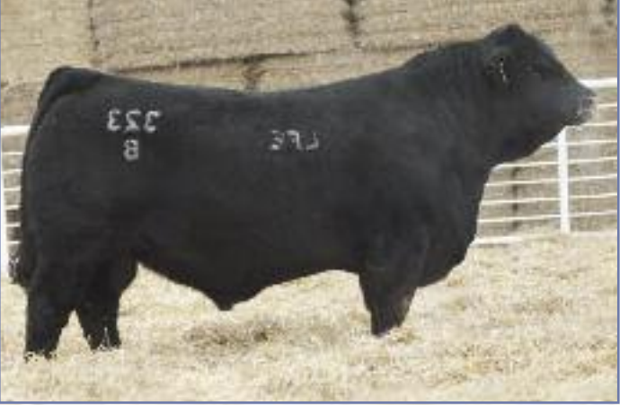
LFE The Riddler 323B (Sire lot 53-55)