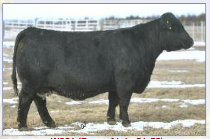
W951 (Dam of lots 51-53)

A stunning ET heterozygous black, homozygous polled son of GLS Integrate and our Dual Focus donor cow. Integrate sires bulls that are wide based, moderate framed and full of muscle. The following embryo bulls were raised in a large commercial herd with no creep, so they have a bit of catching up to do, but by breeding time will show their stuff! Full brother to H1051. Buy with confidence!