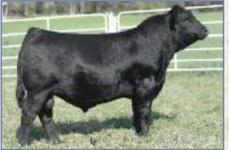
WS Proclamation E202