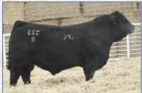
LFE The Riddler 323B