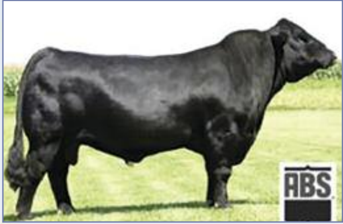
CNS Dream On L186 (Sire lot 56 & 57)

Here is a ET full brother to H1039, but he is homozygous black and homozygous polled. Another stunning son of Riddler and the beautiful 196X donor cow, his performance numbers are also at the top of the breed. He is in the top three percent for yearling EPD and top four percent for wearing and ADG EPD's. When you look at his marbling and REA with moderate calving, he is the total package!