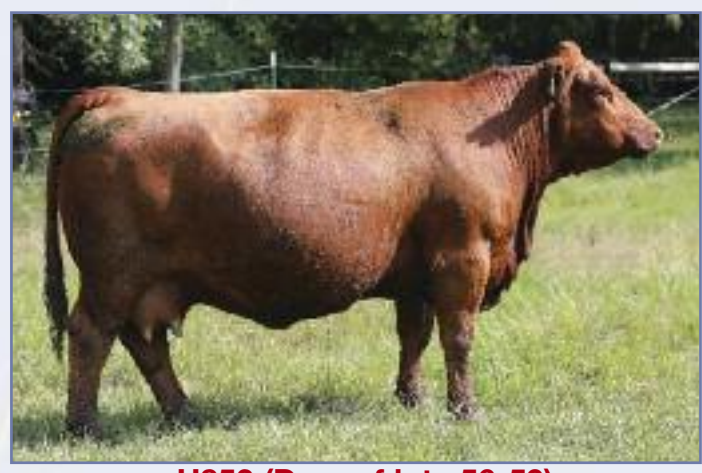
U853 (Dam of lots 56-59)