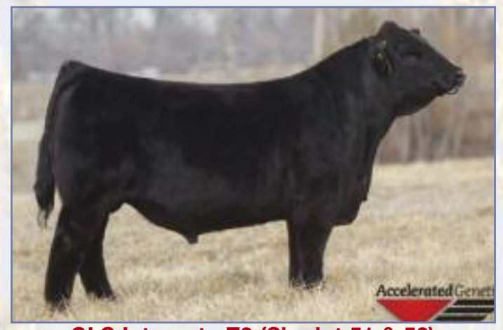
GLS Integrate Z3 (Sire lot 51 & 52)