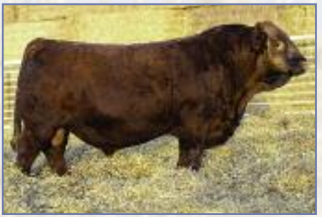
WFL Westcott 24C