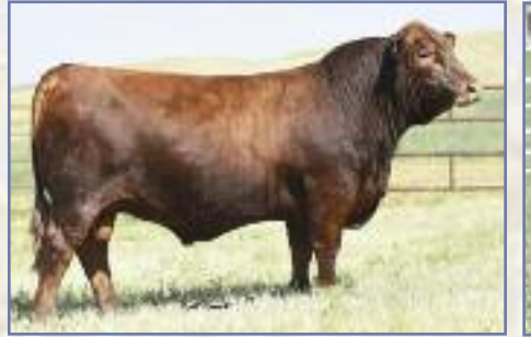
CDI Perception 254E